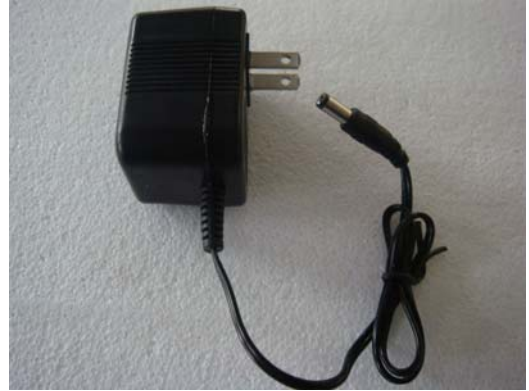
B. Fountain Light Transformer (1)