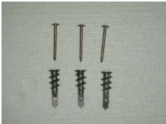
E. Wall Anchors(3)