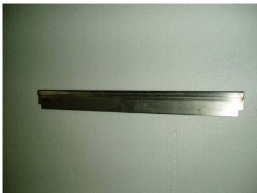
G. Splash Guard (1)