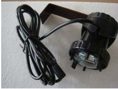
A. Fountain Light (1)