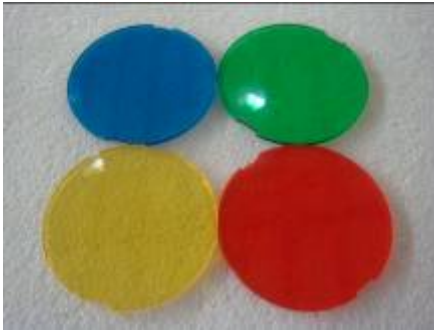
C. Light Diffuser (1)