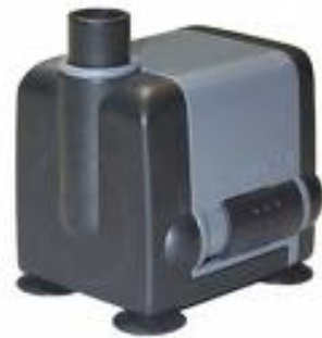
D. Pump (1)