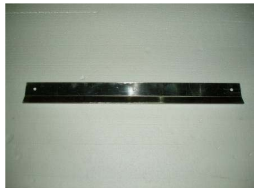
F. Wall Bracket (1)